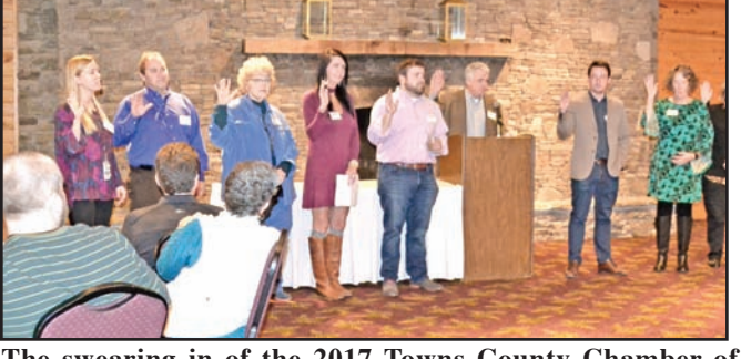
The swearing in of the 2017 Towns County Chamber of Commerce Board Members at the annual appreciation meeting on Thursday, Jan. 19.